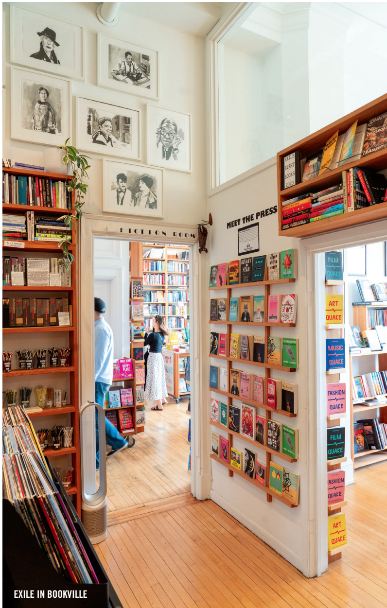
EXILE IN BOOKVILLE