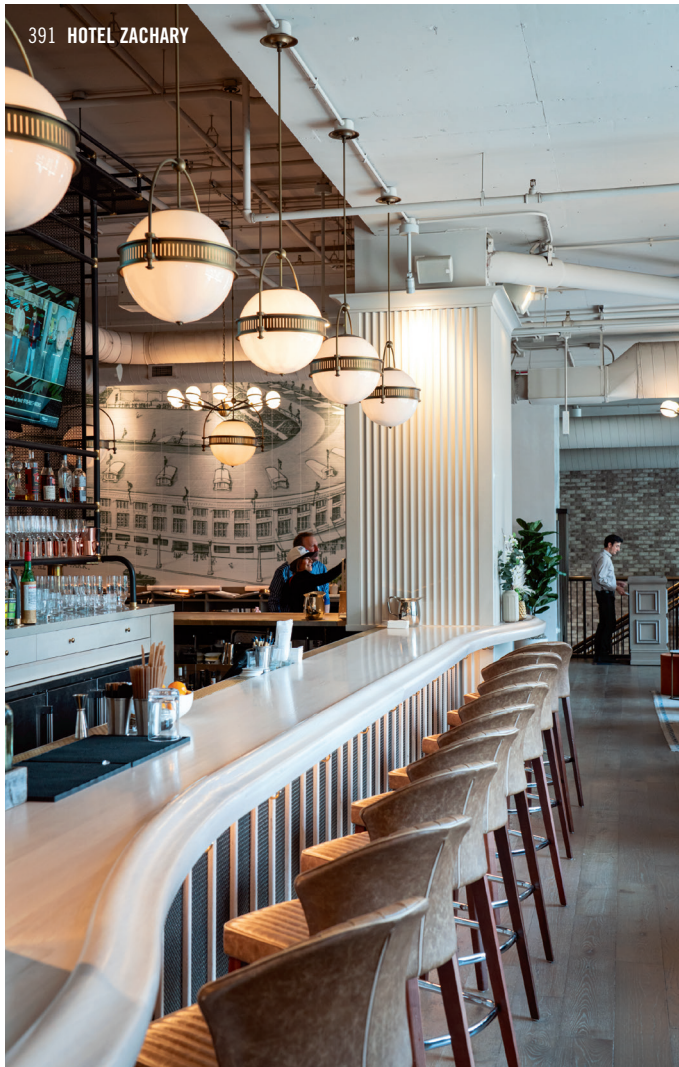
391 HOTEL ZACHARY