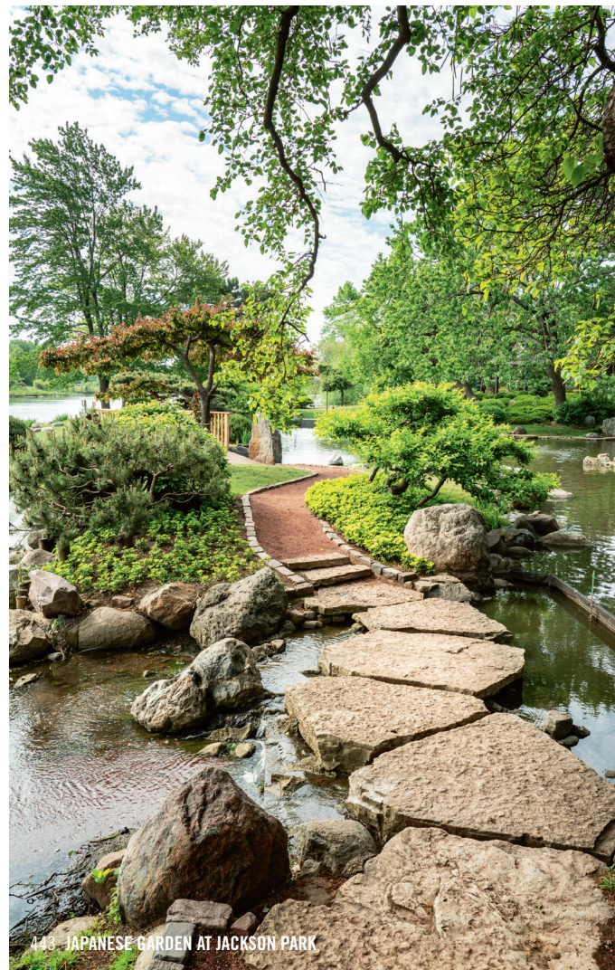
443 JAPANESE GARDEN AT JACKSON PARK

A state-of-the-art sound system and genius quick-dry drainage system make this green patch adjacent to Pritzker Pavilion one of the poshest lawns in the city. During summer evenings, the Frank Gehry-designed bandshell hosts free concerts, and the city flocks with picnic baskets to enjoy the twilight soundtrack.