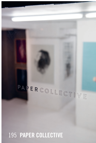
195 PAPER COLLECTIVE