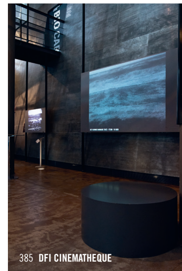
385 DFI CINEMATHEQUE

The Danish Film Institute features an extensive film, stills, and poster archive, a bookshop, and – best of all – three cinemas that screen over 60 films a month, many of which are in English or will feature English subtitles.