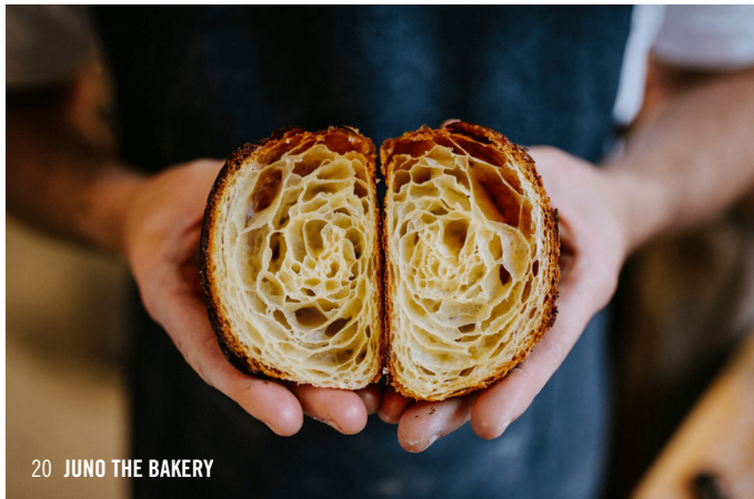
20 JUNO THE BAKERY

Meyers Bageri is the small chain of organic, artisanal bread and pastry shops scattered throughout Copenhagen that originate with Claus Meyer, one of Denmark's culinary superstars. But rather than succumbing to rapid over-commercialisation, the Meyers bakeries have stayed small, local, and committed to quality.